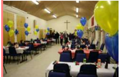
The hall is ready - will they come?

It was on, then perhaps it was off, then the decision was made to get the team of volunteers at the hall as early as possible to prepare the room. We had to shorten the event as we did not have space or facilities to provide overnight accommodation!!